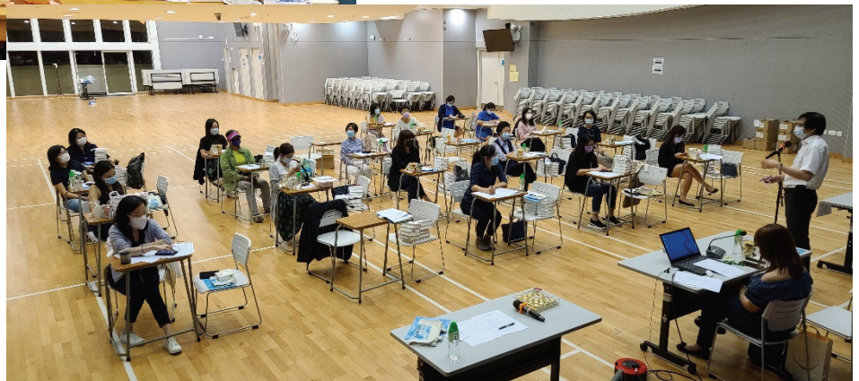
Right: Council meeting in 2020

mainly focused on the Centennial celebration, homecoming day, AGM, Founder's Day service, succession of YWGSAA Charity Trust Fund Trustee succession and other administrative matters.