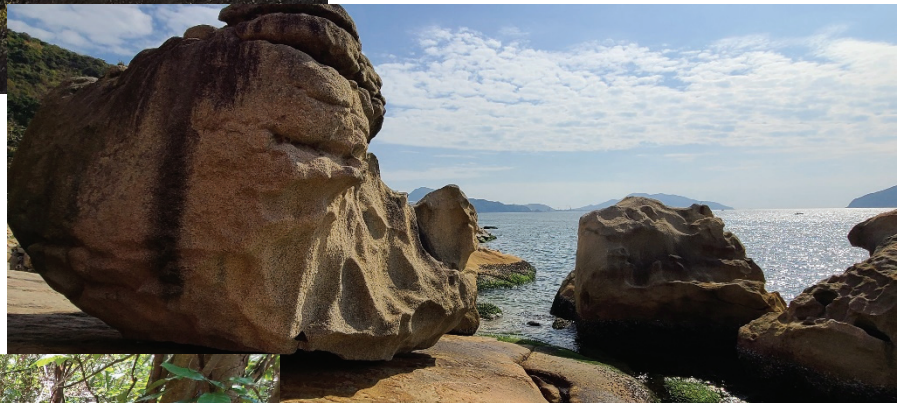
Lee Yue Mun - the only remaining untouched coast line in HK