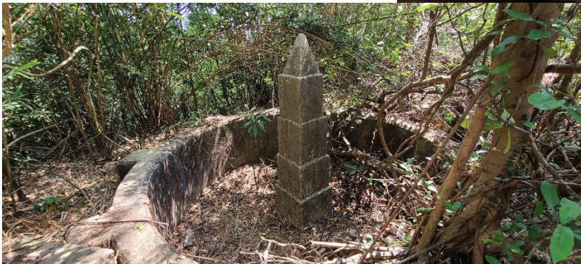
A boundary stone in Tai Tam