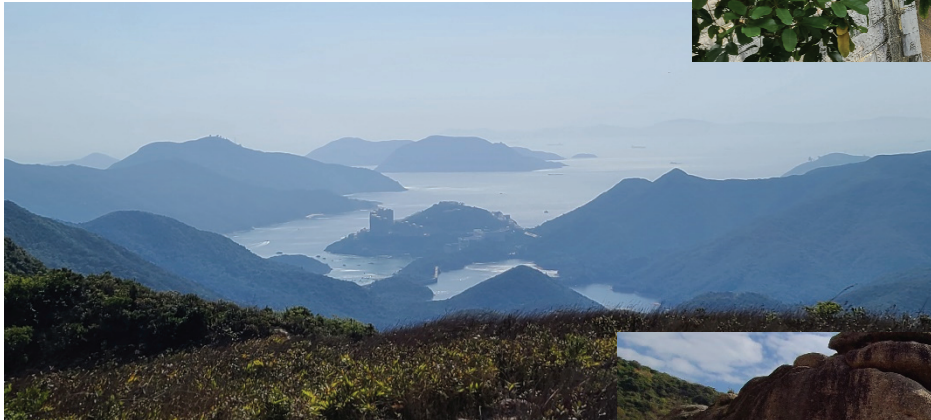
View from Mt. Butler