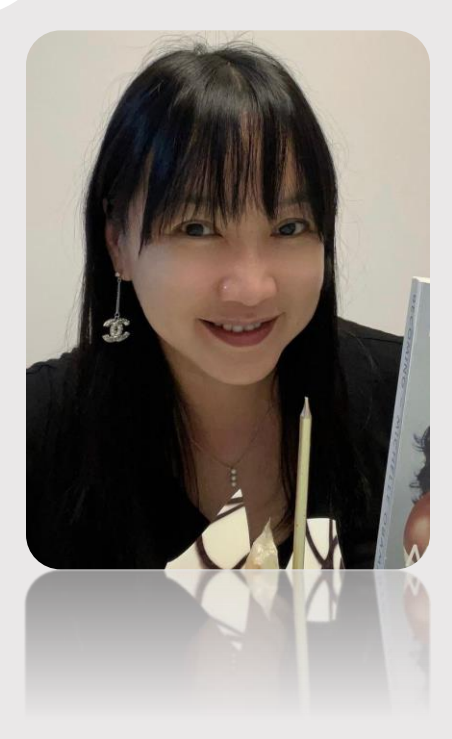
YEAR OF GRADUATION